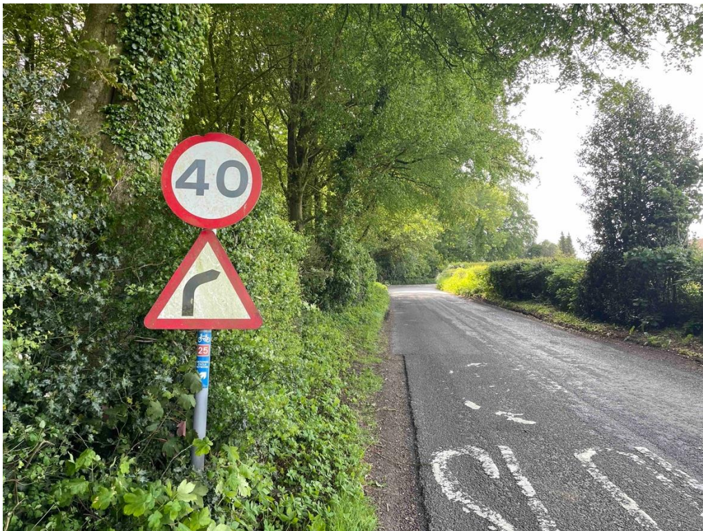
Pic 1: Approach from B3092 on approach to sharp right hand bend.