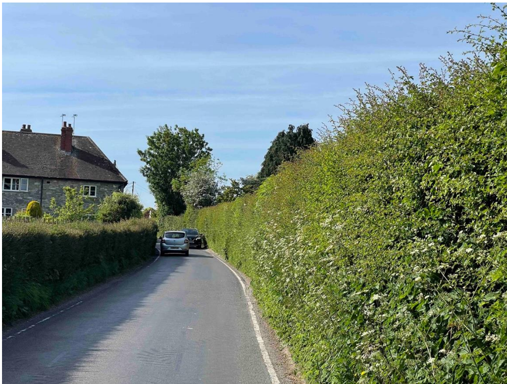
Pic 5: Impossible for 2 cars to pass