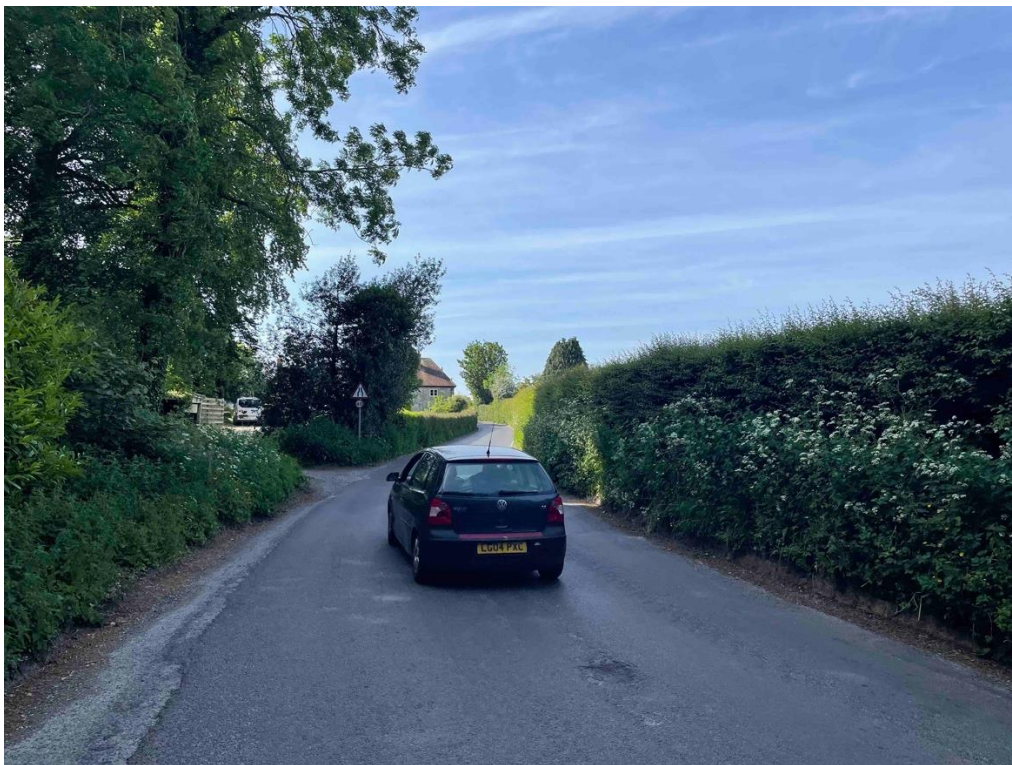
Pic 4: Vehicles travel in centre of road throughout pinch point area.