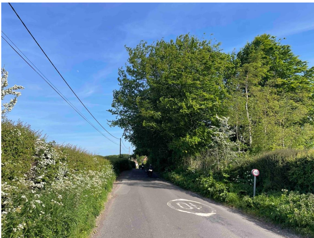
Pic 6: The approach to the pinch point from the opposite direction is hard to see (Note motorbikes with lights on)