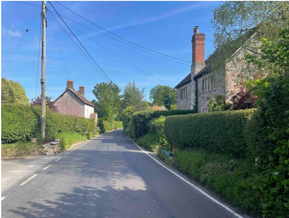
Pic 7: The pinch point only allows one car to pass at a time.